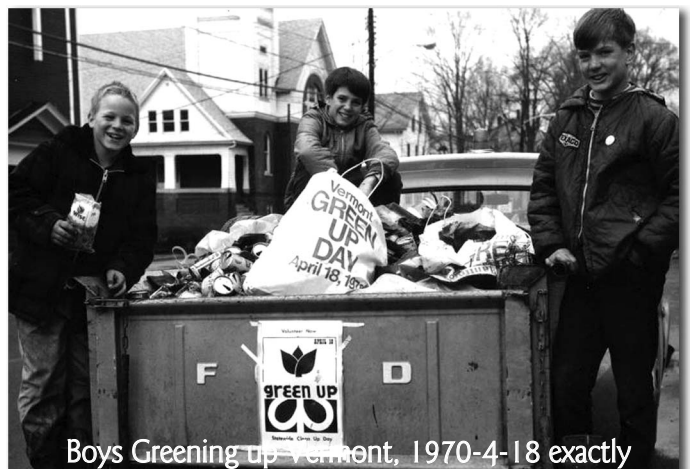
Boys Greening up Vermont, 1970-4-18 exactly

This image shows a US/Canadian border crossing. The photo is in either Highgate or Derby and is on either Interstate-89 or Interstate-91. The stone pillar in the foreground is marking the international boundary. The sign on the left side of the road reads "All vehicles stop at US customs and immigration". The sign also has a french translation on the bottom half.