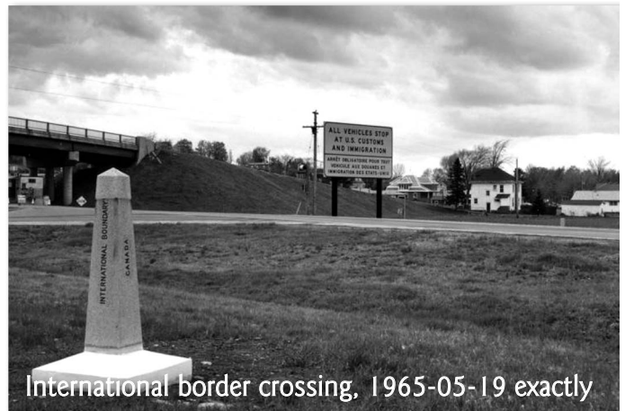
International border crossing, 1965-05-19 exactly